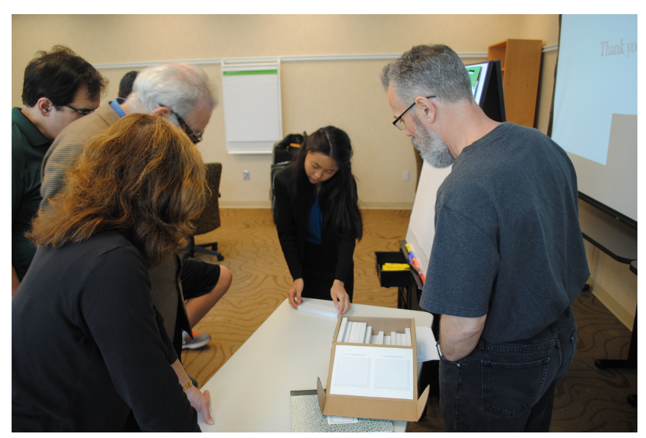
Click to return