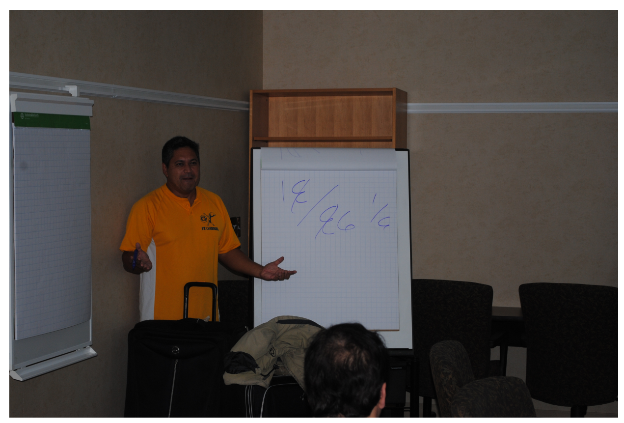
Click to return