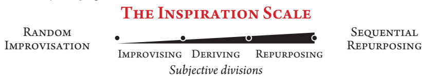
Figure 4: The inspiration scale, related to the source of inspiration for new numerals.

Retention represents a key consideration in the development of a new set of numerals. Another consideration regards the source of inspiration for any new numerals. One may draw from other sets of symbols in the public lexicon, such as from alphabets or musical notation, and append the set in sequence where seen fit. This “sequential repurposing” represents a more conservative extreme. New symbols are added, but they are somehow familiar and in sequence. One might also devise new symbols entirely randomly and ascribe a meaning to them, “random improvisation”, representing the other extreme. This scale is more complex than the retention scale; let’s examine examples.