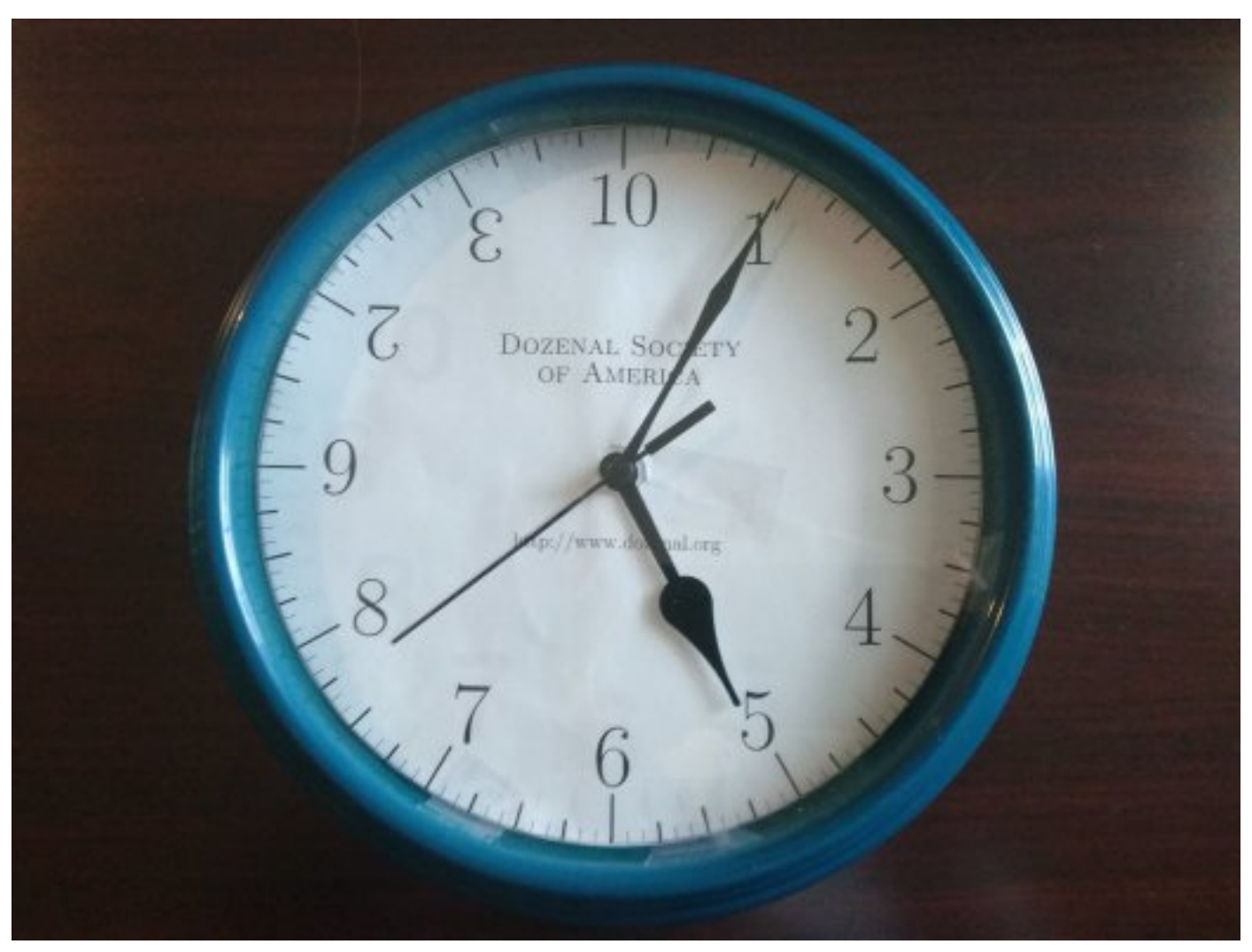
Click to return