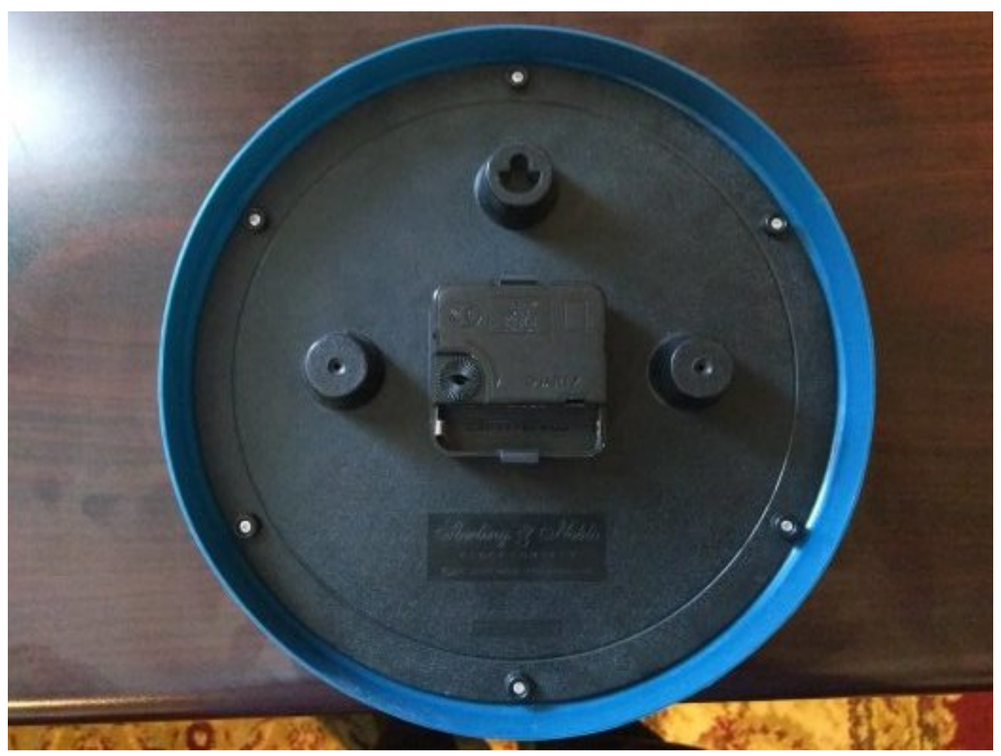
Click to return