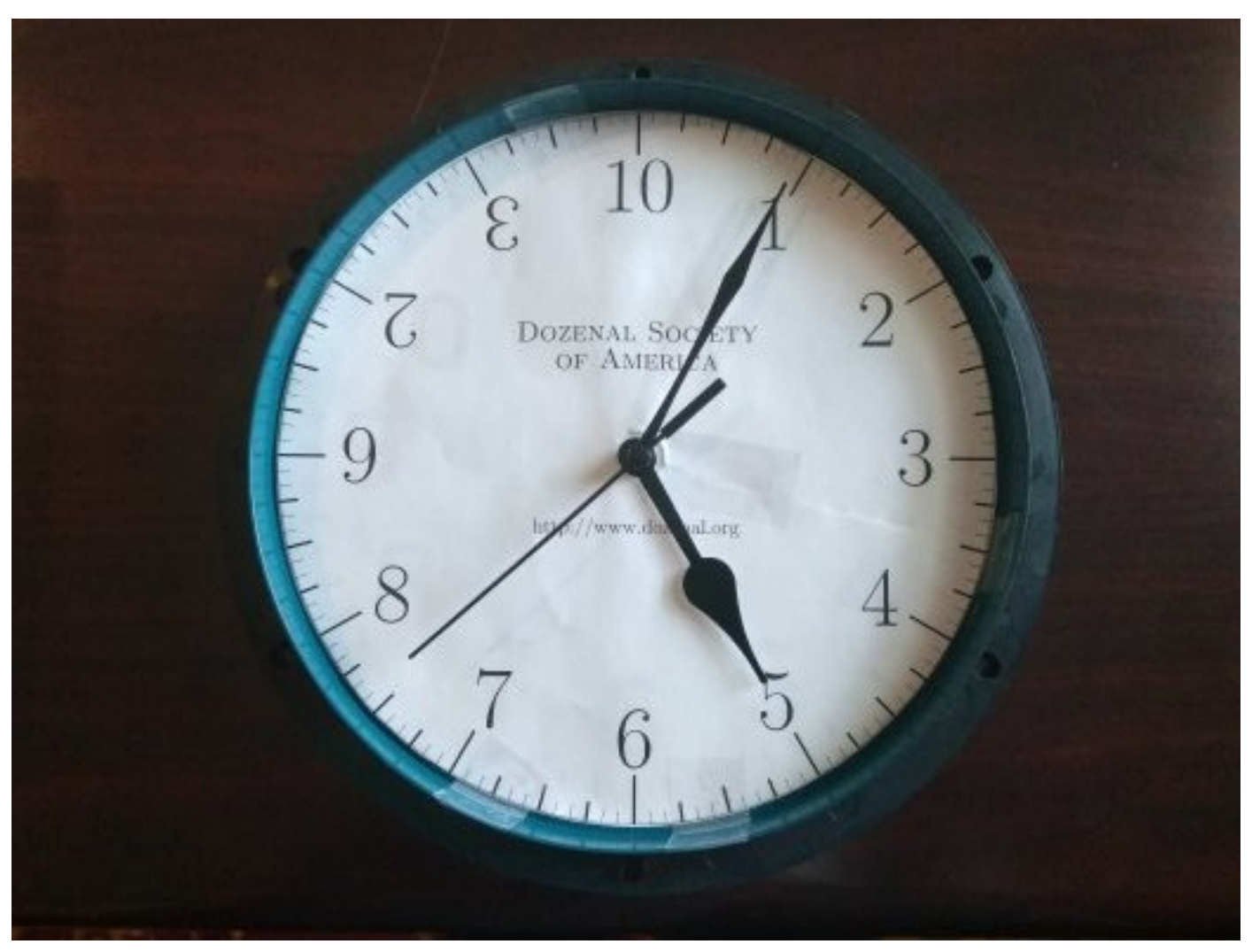
Click to return