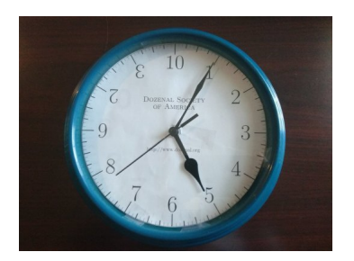
Click for Full-size Image

Now, the only thing left is to reattach the back: