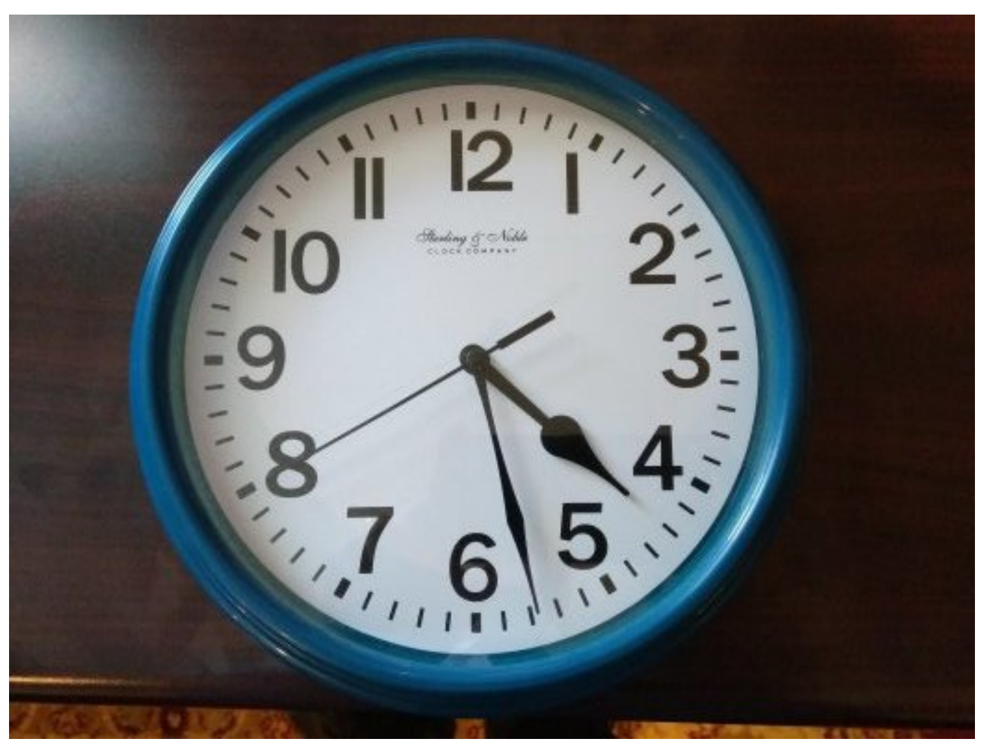
Click to return