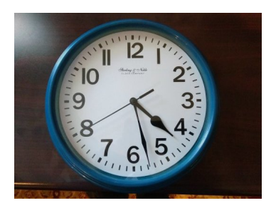
Click for Full-size Image

Start by purchasing a simple, cheap plastic wall clock, of the sort that graces the walls of classrooms, offices, and kitchens all over the country. Something like this, which your author purchased for about $3;6 at a local thrift store: