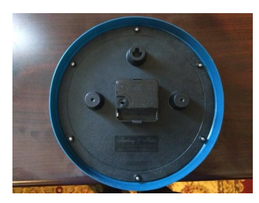
Click for Full-size Image

There will always be a way to disassemble this clock easily and non-destructively; that is, such clocks will be able to have their glass faces removed without breaking (there is no question of disassembling the motor itself, which is unnecessary with this method). For this clock, there is a simple set of screws on the back: