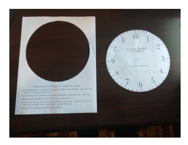
Click for Full-size Image

Now comes the only part that's even remotely tricky: attaching the printout to the clock face. The hands will get in the way. I've found that the easiest way is to cut a slit to the center of the printout, then cut out a hole to accomodate the hands; if you can think of a better way, please let me know.