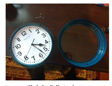
Click for Full-size Image

Simply remove these screws, and you'll find that the back (with motor, face, and hands attached) will pop right off: