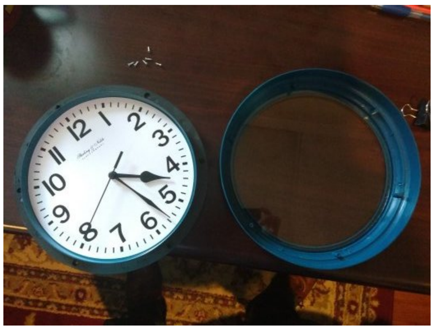
Click to return