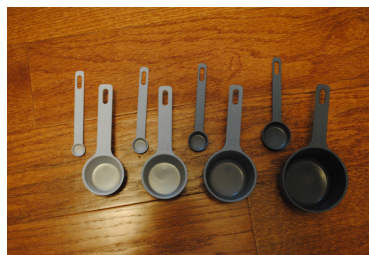
Click for Full-size Image

So measuring cups and measuring spoons typically come in matching sets, and those sets typically consist of some very well-defined volumes. For example, here's the set of measuring cups and spoons that we'll be dozenalizing: