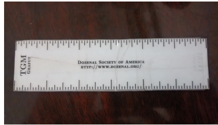
Click for Full-size Image

Carefully position the paper scale onto the base material and tape it together, being sure to cover all the paper with the protective tape and wrapping all around the base material, as well. Eventually, you should end up with something like this: